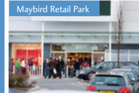
Maybird Retail Park