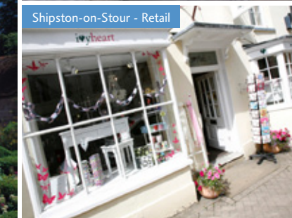
Shipston-on-Stour - Retail