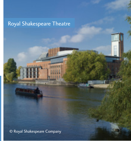
Royal Shakespeare Theatre