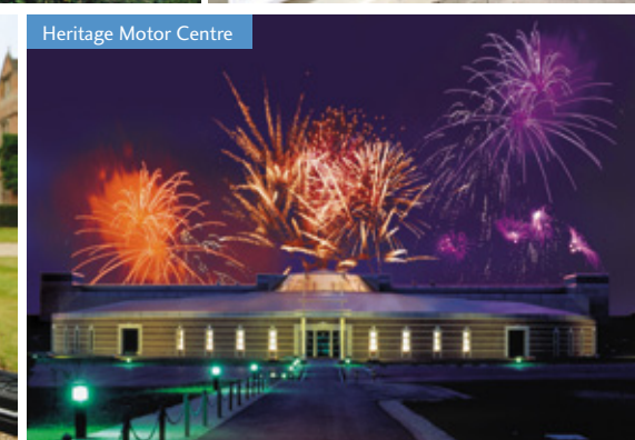
Heritage Motor Centre

“Jaguar Land Rover is proud to work in Warwickshire and champion Inward Investment in the region.....our Engineering Centre in Gaydon is at the forefront of this and employs thousands of engineers and technologists from across the county.”