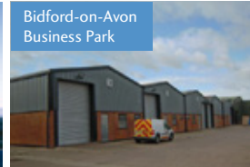
Bidford-on-Avon Business Park