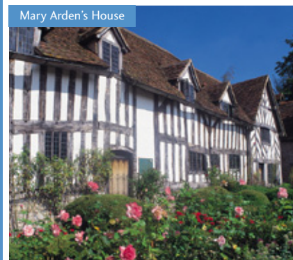
Mary Arden's House