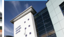
Eleven Arches House