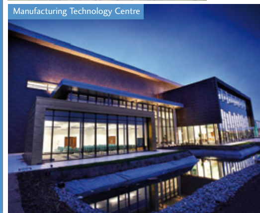
Manufacturing Technology Centre