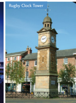
Rugby Clock Tower