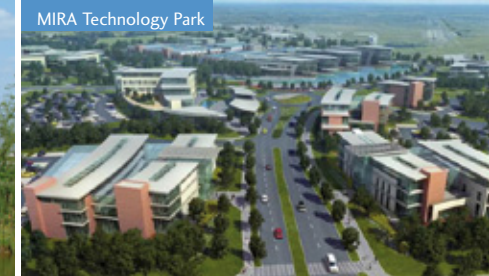
MIRA Technology Park