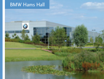
BMW Hams Hall