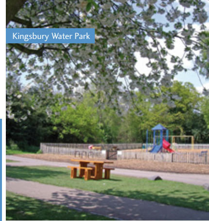
Kingsbury Water Park