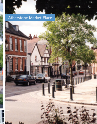
Atherstone Market Place