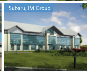
Subaru, IM Group