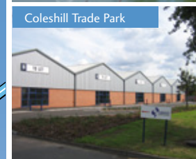
Coleshill Trade Park