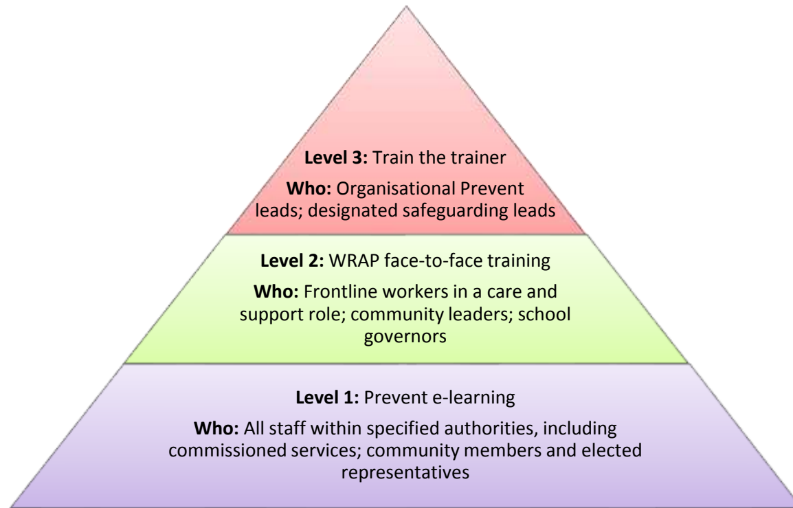
Figure 2: Warwickshire Prevent Learning & Development Framework